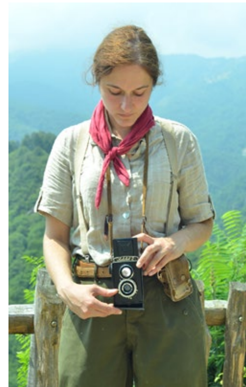
In game photo documentation. I ribelli della montagna (in game).